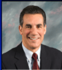
JACK M. CIATTARELLI Director